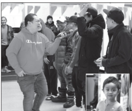
Following a robust potluck meal and musical entertainment, fun and games kicked into gear to round out the event.