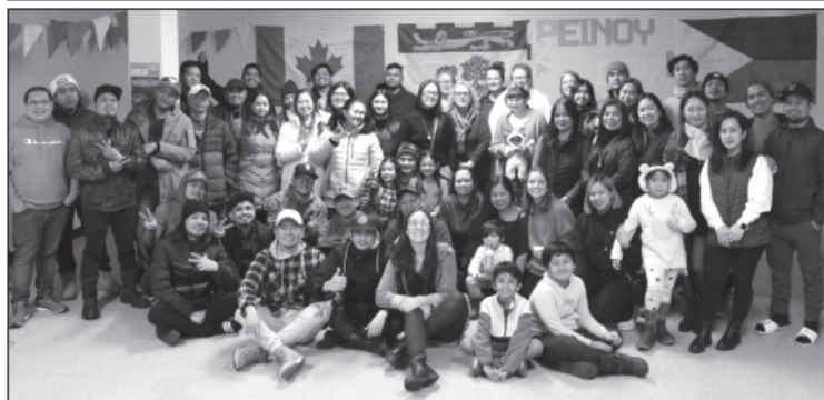
Well over 50 people attended the Filipino culture event hosted at the Cavendish Farms Wellness Centre in Montague on Sunday. Community organizers were excited to share culture and build connection with the broader Kings County community. The group played games, enjoyed food in the form of a pot-luck, performed music and socialized.